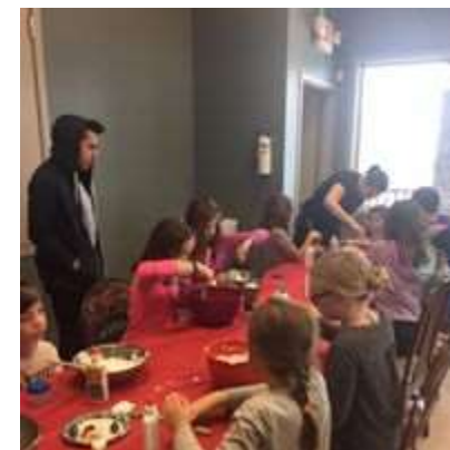
Student volunteers assist some enthusiastic slime makers