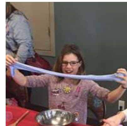
That’s some pretty amazing slime!